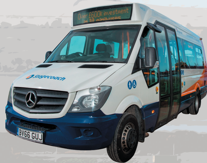
Service No.22 Inverness - Culbokie Monday to Friday

Initially, yes that is the plan and the existing 21 service through the FCC area to Cromarty and Dingwall remains as a fixed route service. If the pilot goes well, a Phase 2 trial of 'demand responsive' services for journeys between Cromarty and Dingwall will be considered but only after extensive consultation.